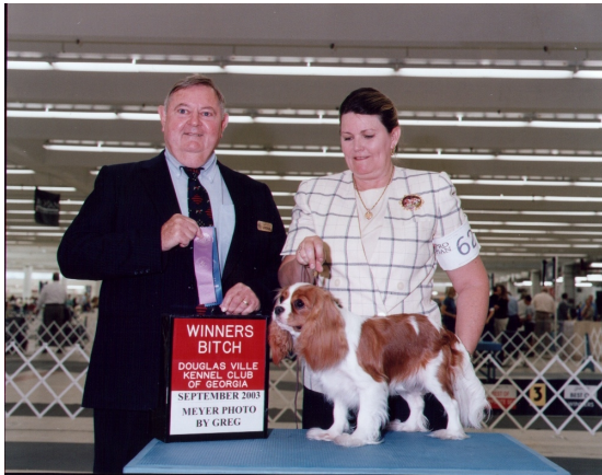
CH St Jon Breathless (Ariel) - First Major