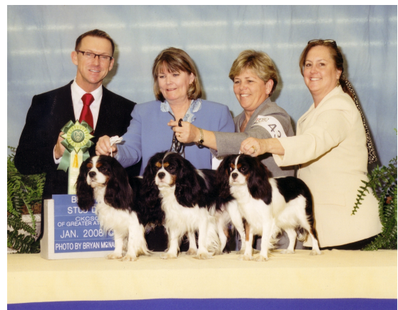
CH St Jon Live Wire (Pierce)