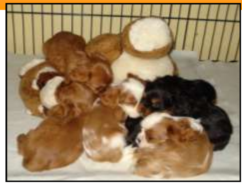
Ch. Max Doby Rok x Rock Cliff Farm Minx, at 6 weeks