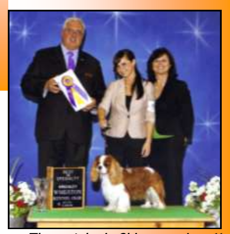
The next day in Chicago on June 11, 2011 "DJ" goes Best in Specialty Show again in back to back specialties under breeder judge David Kirkland. Now he has won BISS in all 5 of the specialties he has been to. "DJ" went on to win a Group 3 later on that same day!