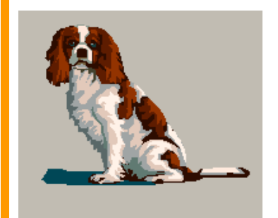
Riverside West K.C. 5-31—6-3 closes 5/16 Biloxi, MS

Paducah K. C. 6-9-10 closes 5/23 Kentucky