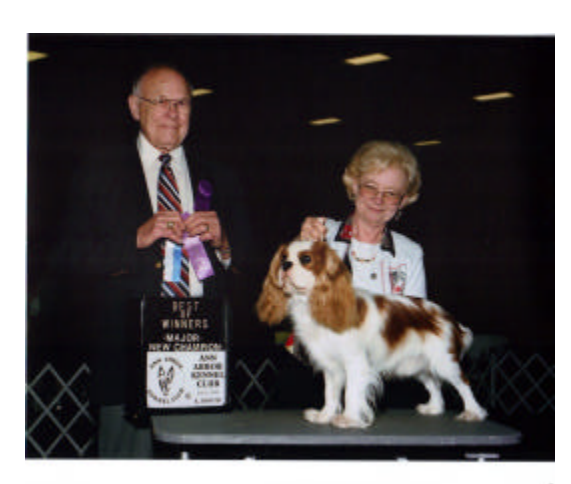
CH Droleus In It To Win It JW Tomnil Cream of the Stars x Wightisle She's Magic