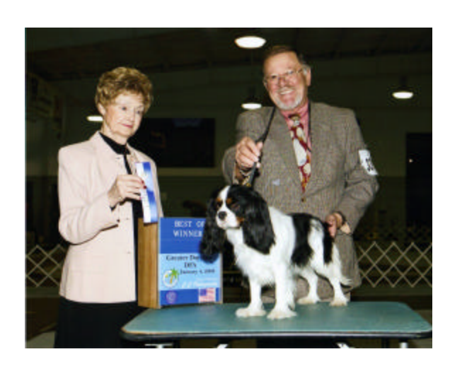
CH Rock Cliff Farm Allan (CH Northwoods Also In Tri x Rock Cliff Farm Dutchess)