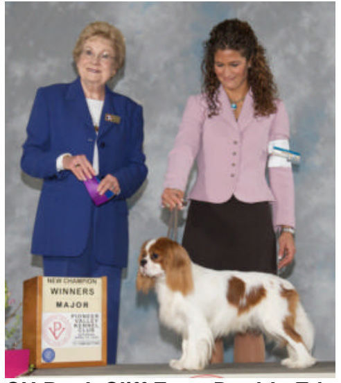
CH Rock Cliff Farm Double Edge (Ch Northwoods Also In Tri x Rock Cliff Farm Mdmsll Maxine)