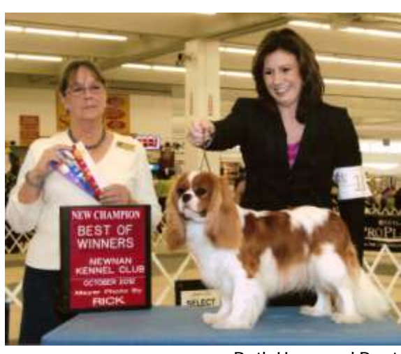
WINNERS BY ECRETIC