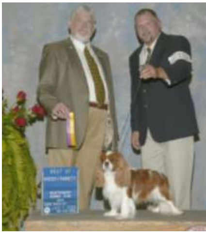
Meet Signature's Creme Brulee. AKA Scooter. This is a pic from one of his breed wins at the Montgomery AKC show